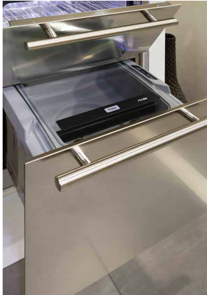
VACUUM DRAWER 45cm