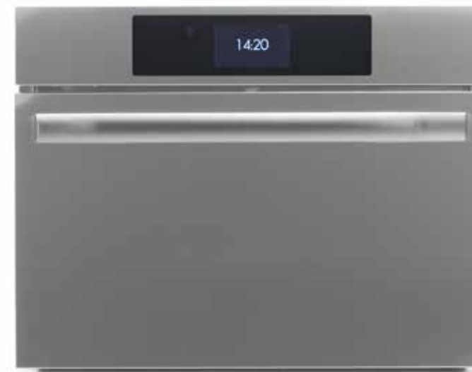
Total stainless Steel