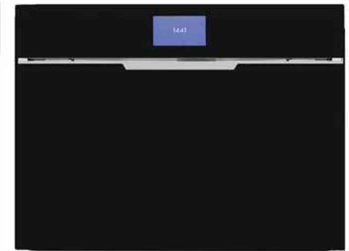
Total black - handle less